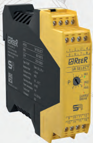
SR Select Multi-functions interface